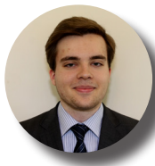
Oleksandr Yusupov Westminster Politics